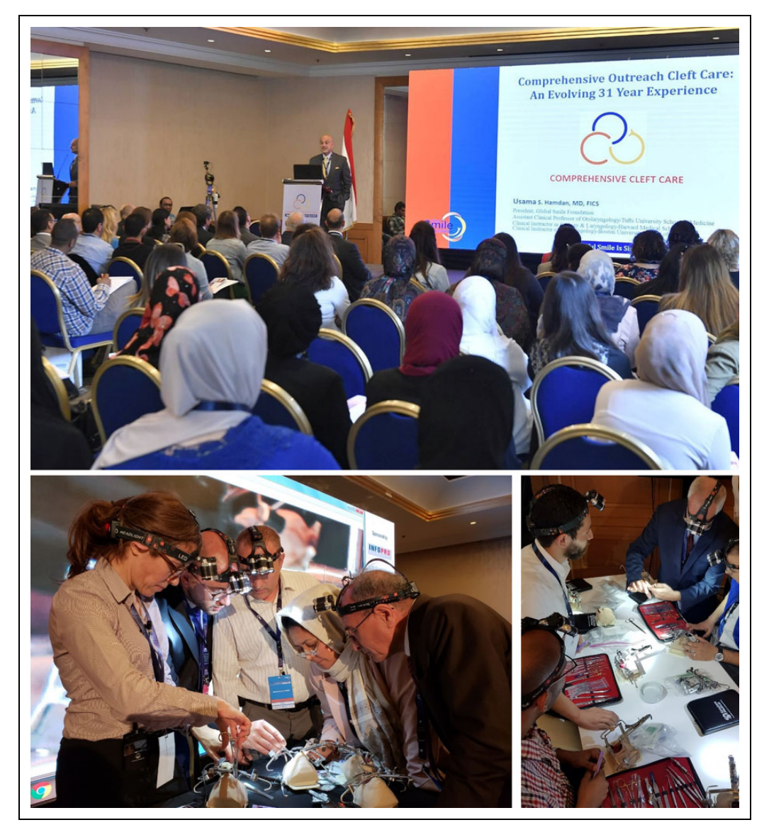
Figure 1. Workshop design including didactic lectures (upper), hands-on surgical simulation sessions using high-fidelity cleft lip and palate simulators (bottom left and right), as well as surgical, speech and language pathology, and nursing breakout sessions with live demonstrations and applications of didactic curricula.